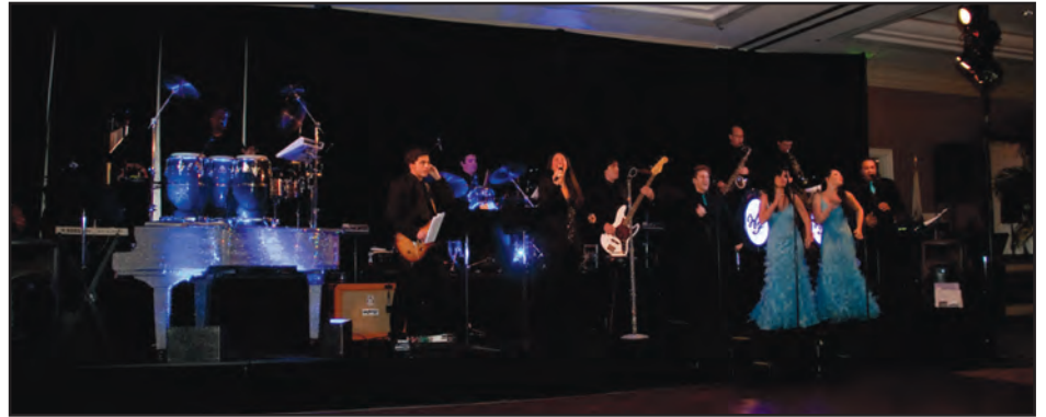
The guests danced the night away to Wayne Foster Entertainment

Proceeds from the event will go to support student scholarships and campus projects that directly benefit students. The 15th Gala is scheduled for March, 24, 2012...Get your dancing shoes ready!