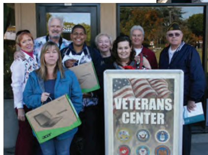
Members of the First Christian Church of Huntington Beach donating new laptop computers for the Center.