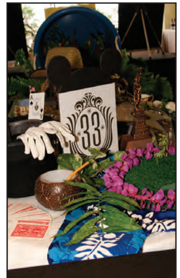
The live auction was replaced this year with a selection of items in the "Bucket List" travel section.