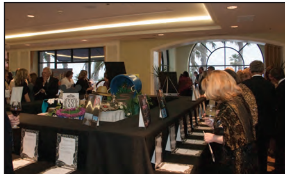
The Silent Auction offered a wide variety and was a huge success.