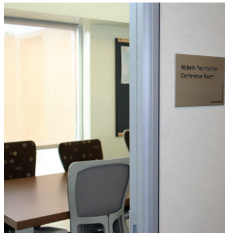
The McBeth Foundation Conference Room