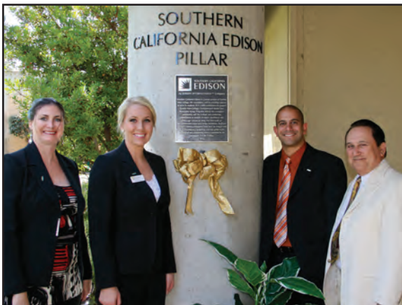
The Southern California Edison Pillar