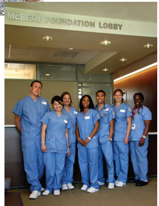
The McBeth Foundation Lobby