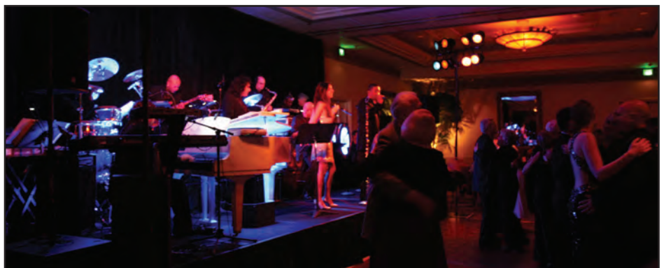
The guests danced the night away to Wayne Foster Entertainment

Proceeds from the event will go to support student scholarships and campus projects that directly benefit students.