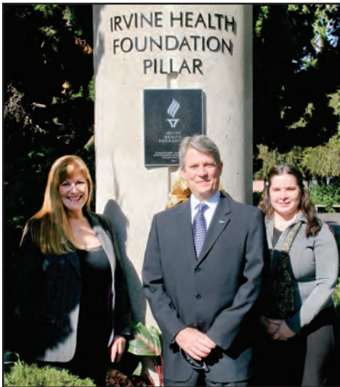
The Irvine Health Foundation Pillar