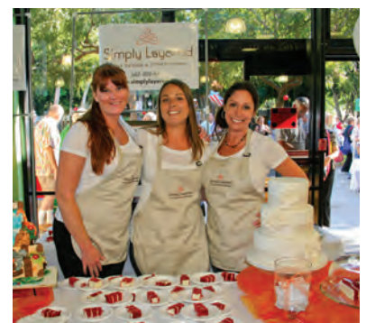
32 restaurants, wineries and breweries participated