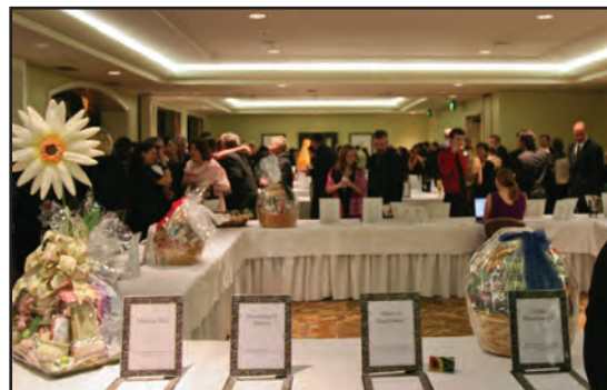
The Silent Auction offered a wide variety and was a huge success.

The 14th annual Gala will be March 19, 2011...get your dancing shoes ready!