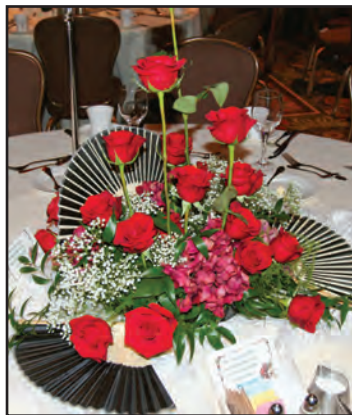
The table arrangements were created by the GWC Floral Design Department