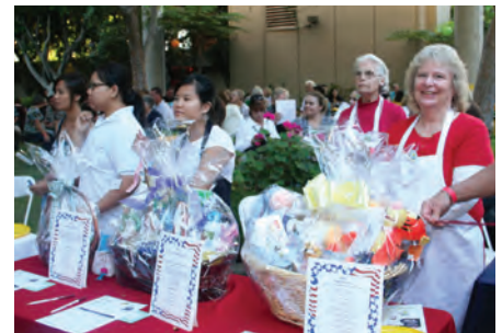
All of the auction items and grab bags were sold.