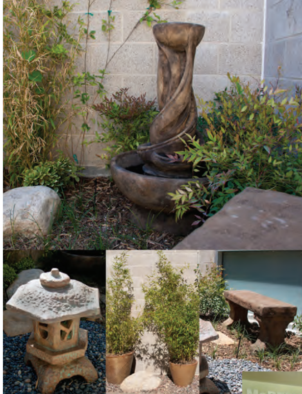
The McBeth Foundation Meditation Garden

As generous supporters of the Golden West College Expanded Nursing Program, the McBeth Foundation has provided funding for the naming of the McBeth Meditation Garden, the McBeth Lobby, the McBeth Conference Room and the McBeth Classroom, all housed in the new Frank M. and Gertrude R. Doyle School of Nursing.