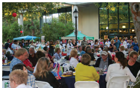
A record number of guests attended the event.