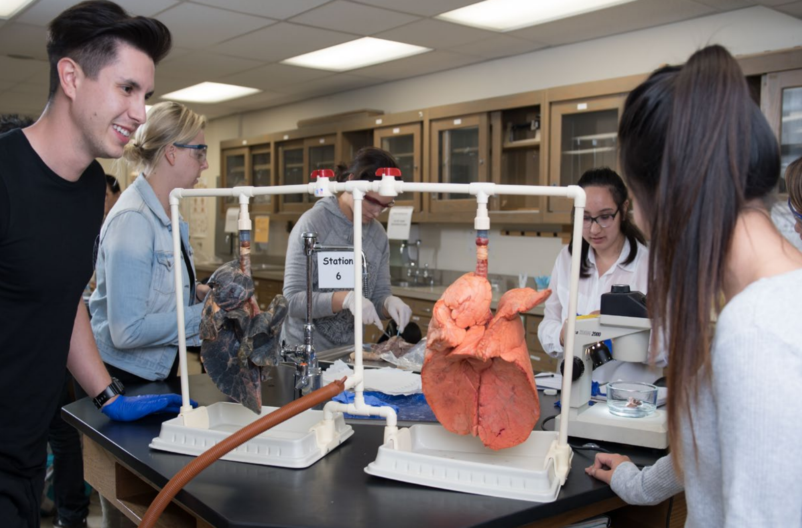
Students take turns inflating swine lungs in the GWC physiology lab.