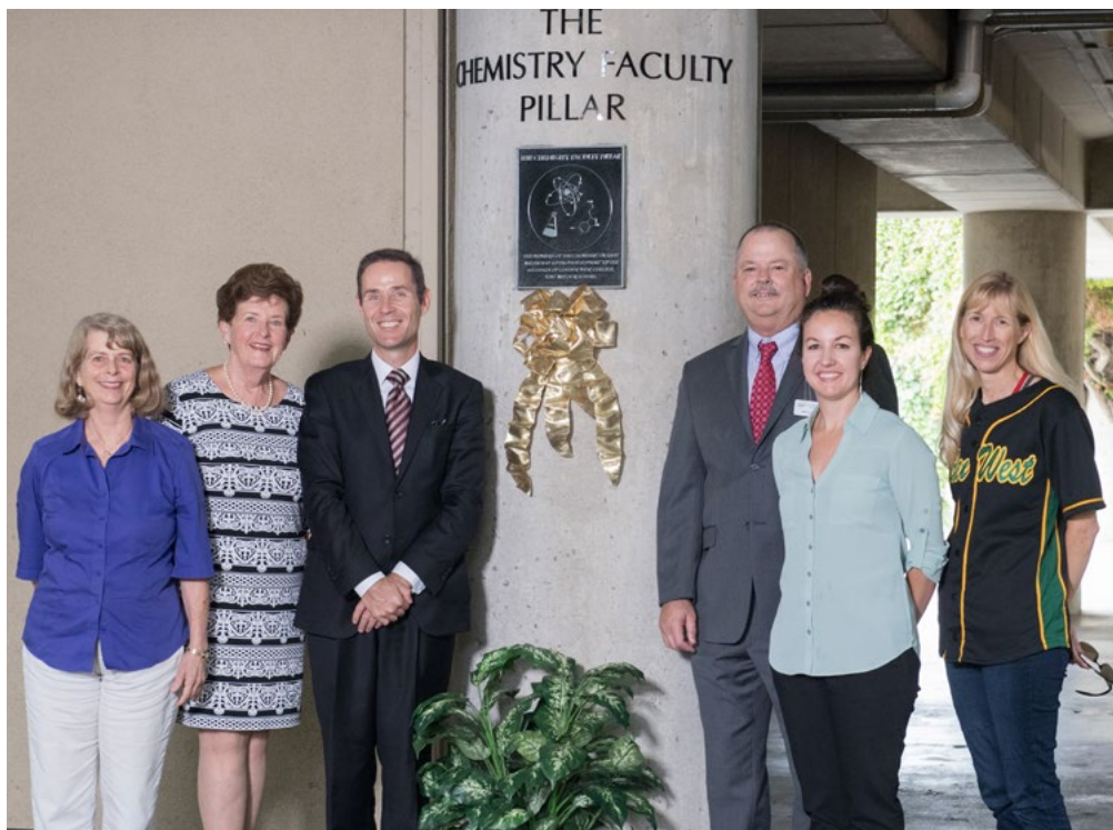
Above: The Golden West College Chemistry Faculty was awarded a Pillar of Support for their sustained financial contributions in excess of $25,000.