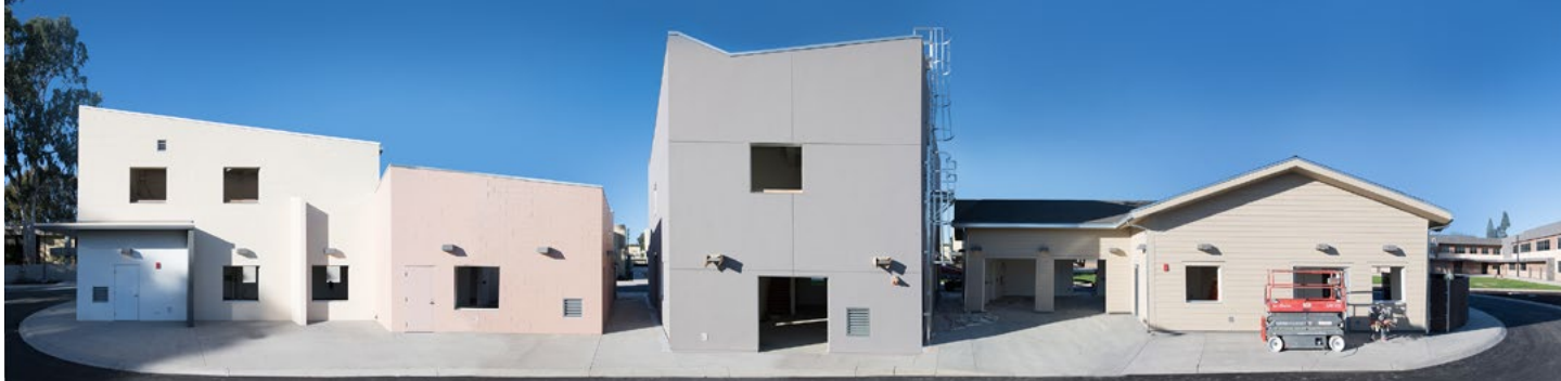
Construction of the Scenario Laboratory Complex at the new Criminal Justice Training Center nears completion.

This is an exciting time at Golden West College. This spring, two new buildings are opening on campus, and as beautiful and impressive as the buildings are, it's the people who'll pass through them, and the impact they'll have on our community, that gives them significance.